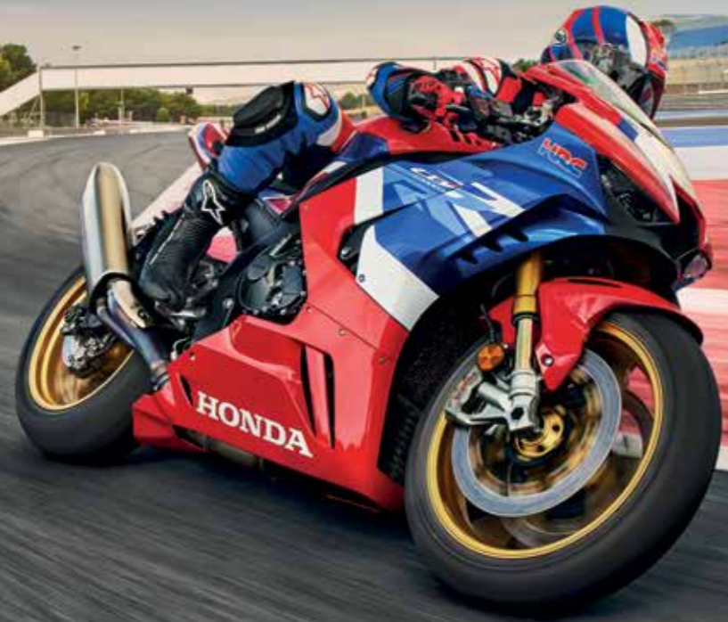
Image shows motorcycle prepared for track use (not available for delivery in this form). Road motorcycle includes indicators, rear view mirrors and number plate.