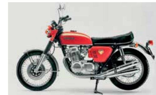
The Dream CB750 FOUR, which hit the market in July 1969

After 5 consecutive titles in the World Grand Prix Road Racing Series, Honda decided to withdraw and turn toward its primary target: transfer the technology obtained in competition to develop high-performance consumer machines. After a first attempt with a 450cc, Honda released the CB750 Four in January 1969. The initial production forecast of 1,500 units a year became soon a monthly figure and then jumped to 3,000 units/month. By pushing the boundaries of performance, reliability and easy handling in motorcycles, Honda created a new class of Superbikes. The CB1000R is the modern expression of the same spirit that guides Honda engineers since decades.